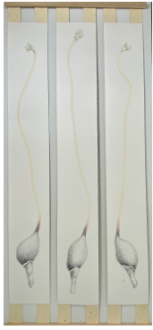
JENNY GILBERTSON RISE Pencil on paper 50 x 120cm POA