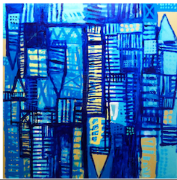
NATHAN HOYLE Spray and acrylic on canvas W100 x H100cm Coming and Going $1080