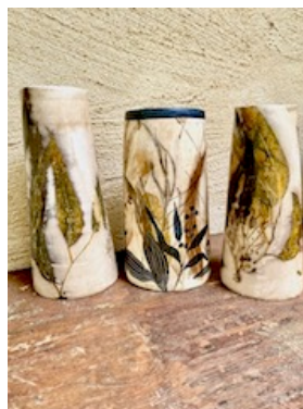
JANE MCNABB Forrest Light 1, 2, 3 Stone Ware c Botanically printed H 20cm base 10cm approx POA

Art works are for sale, unless otherwise stated. To buy an artwork, refer to the artists' details (next page) or call Rosslyn de Souza: 0438 911 346 .